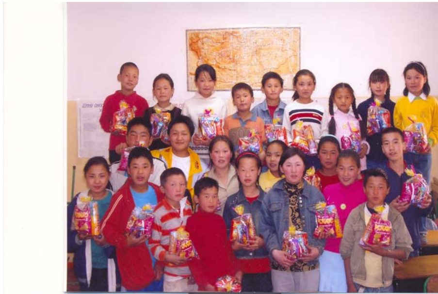
End of the school year