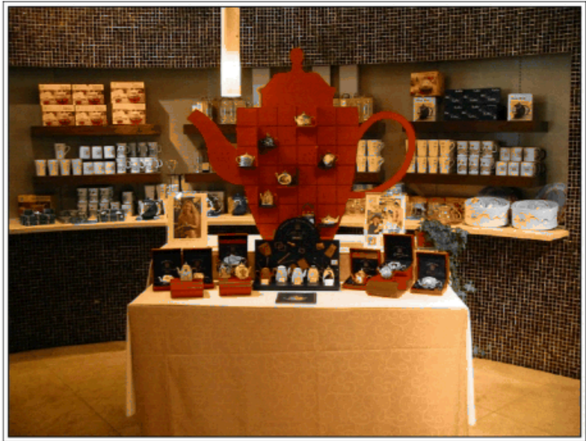
The Charlotte di Vita Collections display at Thos S.B., Raffles Hotel.