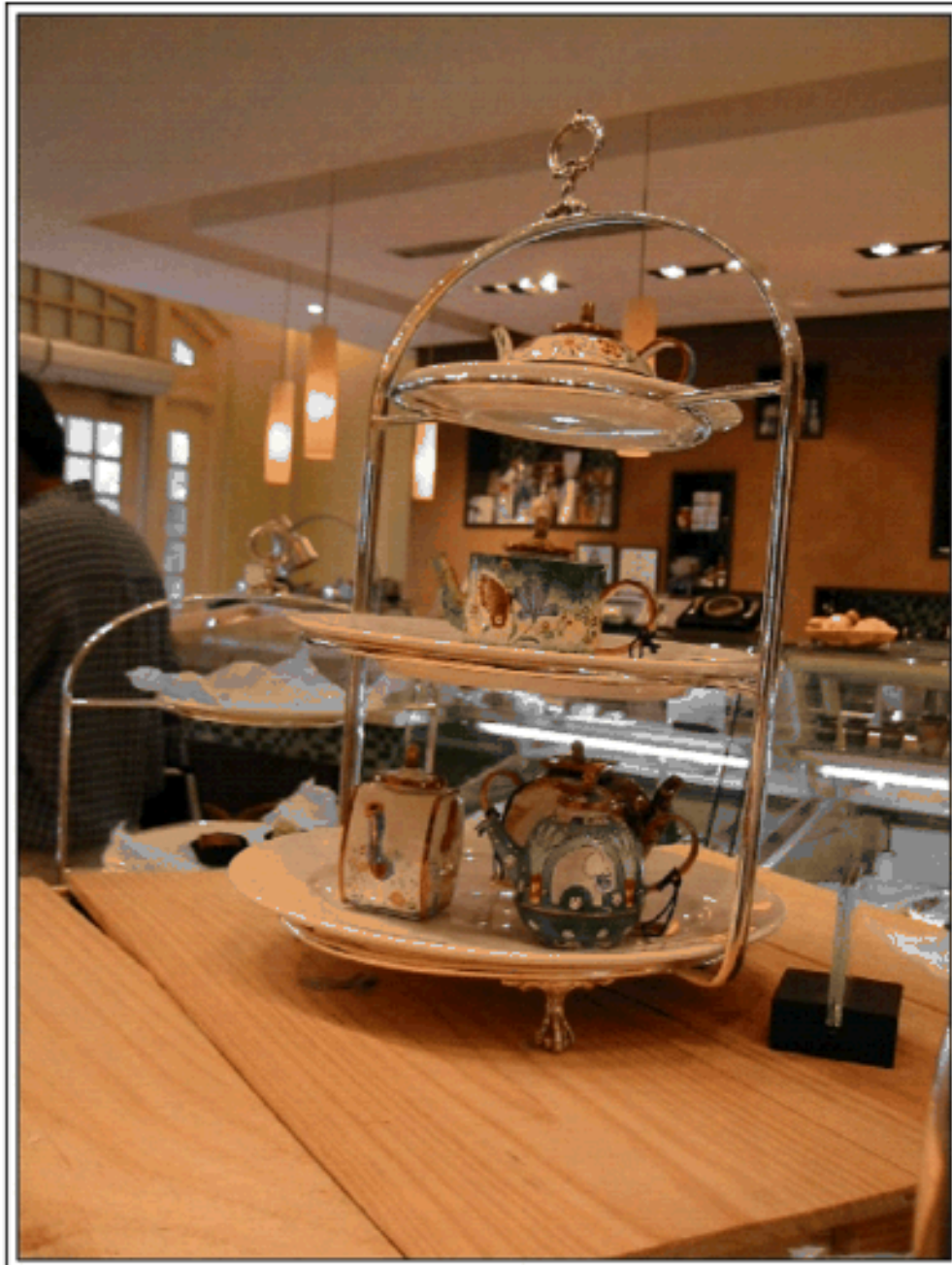
A unique display of the teapots 'served' on platters during the tea party.