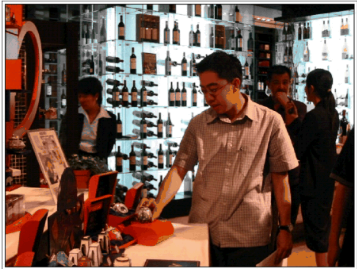
Too many beautiful teapots to choose from! A guest making his choice.