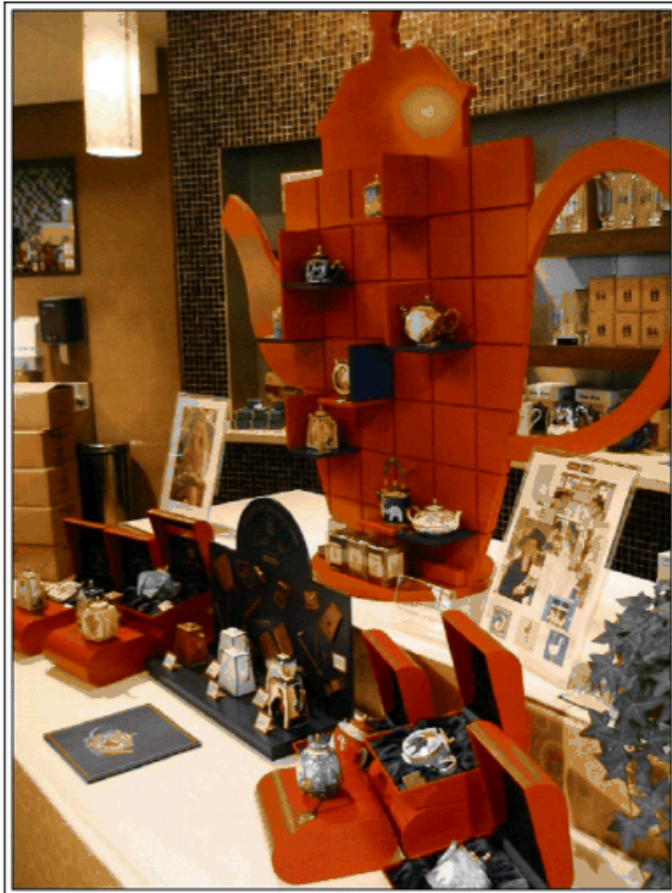
The Charlotte di Vita Collections display at Thos S.B., Raffles Hotel. (Established in 1887, Raffles Hotel today stands as a jewel in the crown of Singapore's hospitality industry)